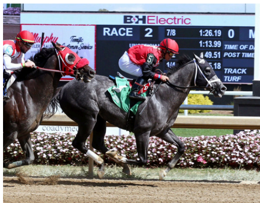
Touchdown Rocket won last time out!