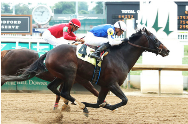
TEMECULA breaks his maiden for MCL-$100,000 at Churchill.

Last Race: 9/14/24 $80,000-N2L @ CD Trainer: Brendan Walsh Conditions Left: N2L Preferred Surface: DIRT