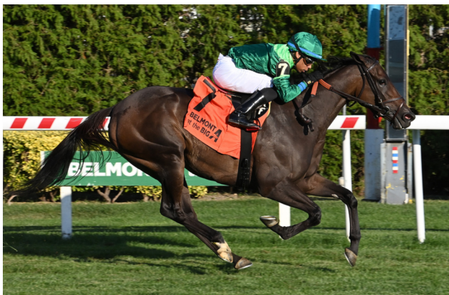
SHADE OF PALE breaks her maiden at the Belmont at Aqueduct meet.

Last Race: 10/12/24 G2 Sands Point @ BAQ Trainer: Chad Brown Conditions Left: Alw-N1X Preferred Surface: TURF