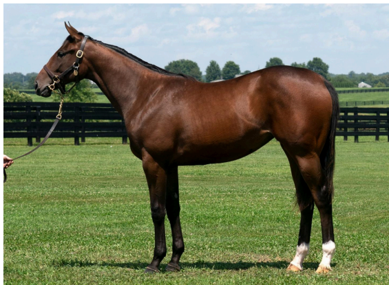
Martingale was a $575,000 Keeneland September Yearling Purchase