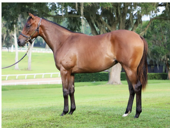
Fashion Victim was a $475,000 Fasig-Tipton Saratoga Yearling Grad