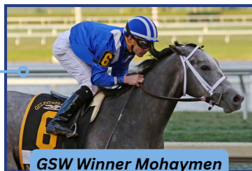
GSW Winner Mohaymen