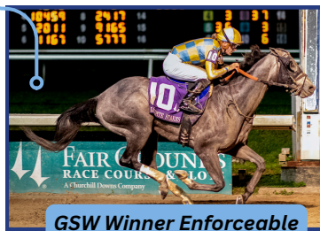
GSW Winner Enforceable