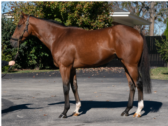
Escalation Clause prepping for the November HORA sale at Dell Ridge.

Last Race: 10/12/24 ALW N1X @ AQU Trainer: Chad Brown Conditions Left: ALW - N1X Preferred Surface: DIRT