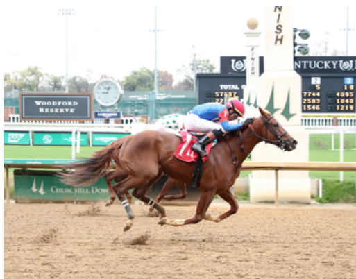
BOUTWELL TIME breaking her maiden at Churchill Downs