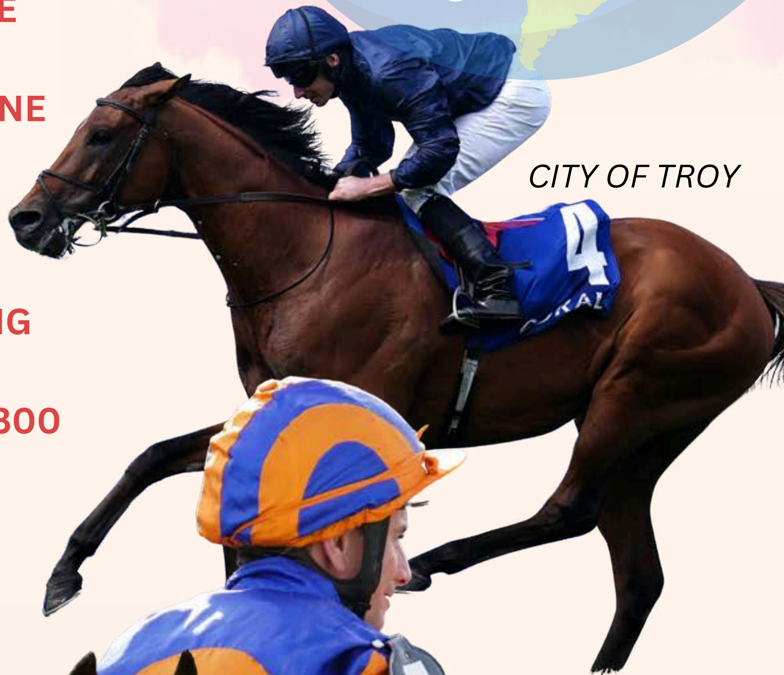
CITY OF TROY