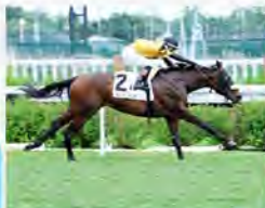
CUGINO won the Audubon Stakes in 2024 at Churchill Downs

Adorable Miss 22' Long Acting (g. War of Will) breeding at Gulfstream Park 23' Essential Quality, c. '25 - bred to Flightline