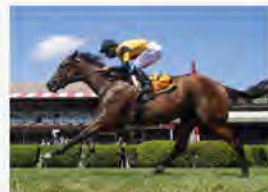
BATTLE OF NORMANDY has won his last three races, including a 3X at Aqueduct on Sept. 20

Money Huntress '24 - McKinzie, f. '25 - bred to McKinzie