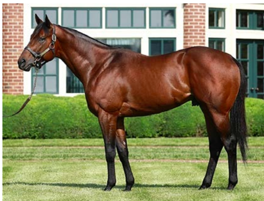
Paris Surprise is a homebred for Haymarket Farm by City of Light.