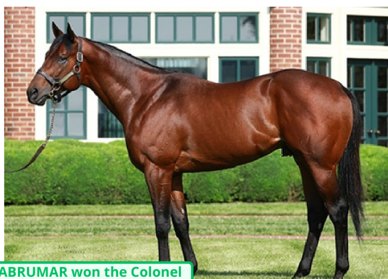
ABRUMAR won the Colonel Liam S. at Gulfstream two starts later