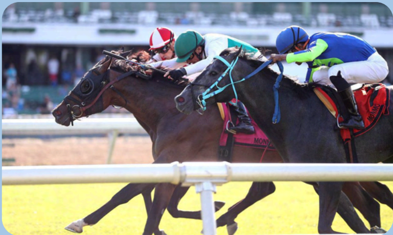
Twirling Point battles in between horses to win the Jersey Derby.