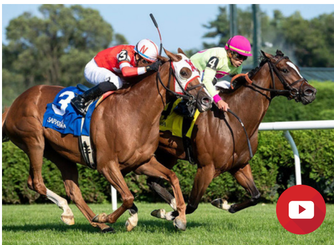
Anna Karenine wins a first level allowance at Saratoga