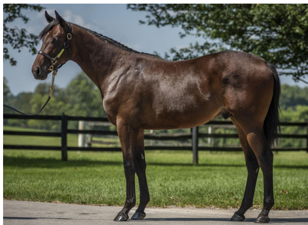
GHOST COAST (pictured here) was a $250,000 Keeneland September Book 1 purchase..