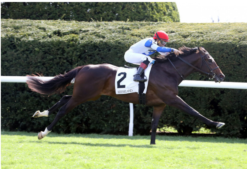
Slipstream wins the 2022 Palisades Turf Sprint at Keeneland

TOO SEXY's 4yo half-sister Jetmore was bred to More Than Ready for her first foal in 2023.