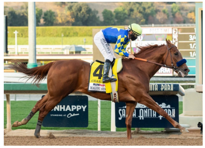
CHARLATAN dominates the G1 Malibu.

Not only has she thrown a strong first foal in a filly by SPEIGHTSTOWN , but she is also a daughter of AWESOME AGAIN . Daughters of Awesome Again have produced 91 Stakes winners worldwide including Champion ACCELERATE and G1W KEEN ICE .