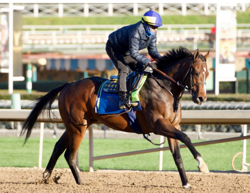
MONTEBELLO training as a 2yo at Santa Anita.