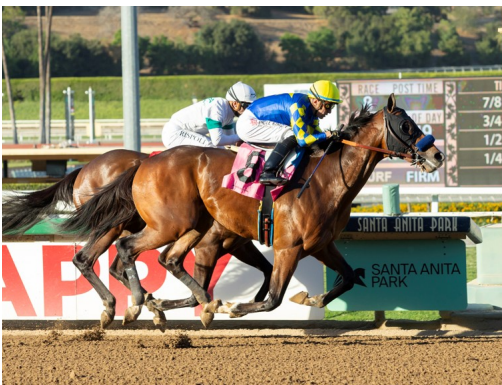
BAROSSA breaks his maiden at Santa Anita.