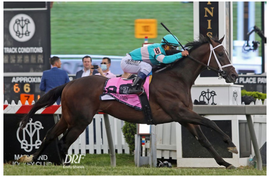
T D Dance coasts home in the James Murphy on Preakness day by 3 ¾ lengths.

In his prior two starts, T D DANCE was narrowly defeated by G2W Bemma's Boy, G3W Monarch's Glen and SW Cash Logistics , while defeating stakes performers G3W Like the King, SW Invader, SW Cash Logistics, SW Mr. Hustle, G1P Glynn County, G2P Midnight Tea Time, G3P Lucky Curlin , Dyn O Mite, Logical Myth, and Argentello (IRE).