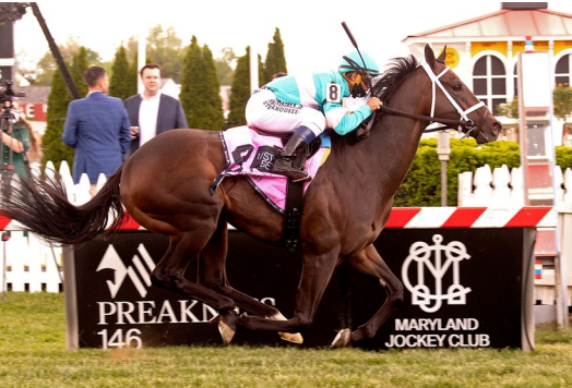
T D Dance romps in the James Murphy by an easy 3 3/4 lengths on Preakness Day 2021.