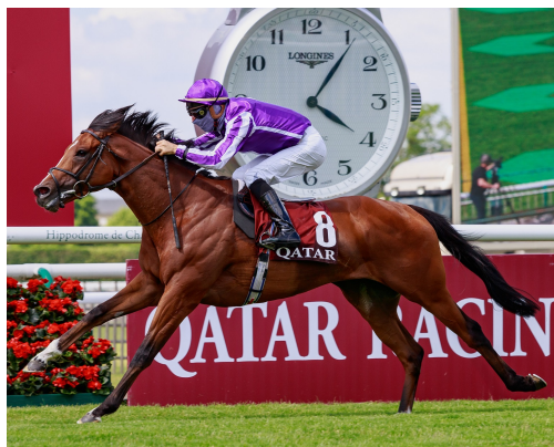
ST. MARKS BASILICA

COUNTERPARTY RISK's 2nd dam is the G3W STEEL PRINCESS , whose daughter FINAL DREAM sold for $1,946,133 at Tattersalls October in 2017 and more recently, her current NO NAY NEVER yearling filly sold for $228,919 at this year's Tattersalls October yearling sale.