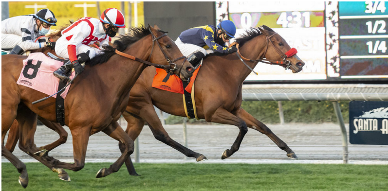
COUNTERPARTY RISK flies late to be 2nd in the Lady of Shamrock.

COUNTERPARTY RISK was making just her fourth career start when she landed the G3 Endeavour at Tampa Bay Downs, beating three stakes performers including MGSP NEW YORK GIRL who was 3rd beaten 3/4 of a length in the G2 Hillsborough and 2nd beaten a half-length in the G2 Distaff Turf Mile at Churchill Downs in her two starts after this race ( Click to view race replay ).