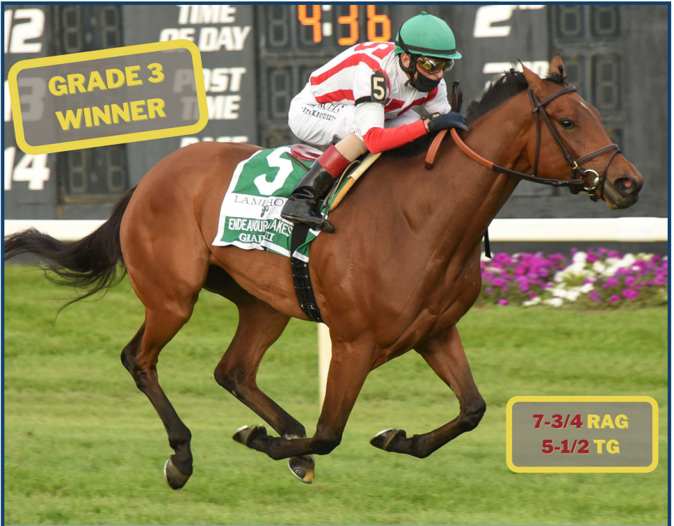
COUNTERPARTY RISK (IRE) wins the G3 Endeavour Stakes in 2021.