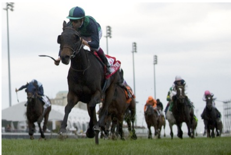
SARAH LYNX upsets the boys in the G1 Canadian International.

COUNTERPARTY RISK sold for $446,799 as a yearling at Tattersalls October Book 1 and is by the dual Derby winner AUSTRALIA out of the 12-year-old Acclamation (GB) mare ANKLET, who is a half-sister to G1W SARAH LYNX , who sold for $2.6 million at Fasig-Tipton November in 2014 , and G3W STEEL PRINCE and G3W SUGAR BOY .