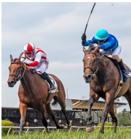
COUNTERPARTY RISK (IRE) closes with a big late kick in the Big Dreyfus S.