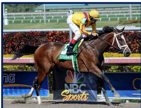
G1W DREAMING OF JULIA (o/o Dream Rush) Wins: G1 Frizette