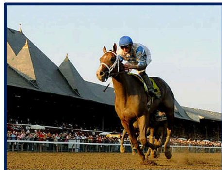
G1W DUBLIN (o/o Classy Mirage) Wins: G1 Hopeful