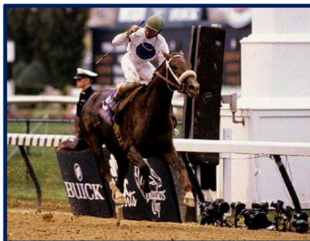
MG1W TIMBER COUNTRY (o/o Fall Aspen) Wins: G1 Preakness, G1 BC Juvenile, G1 Champagne