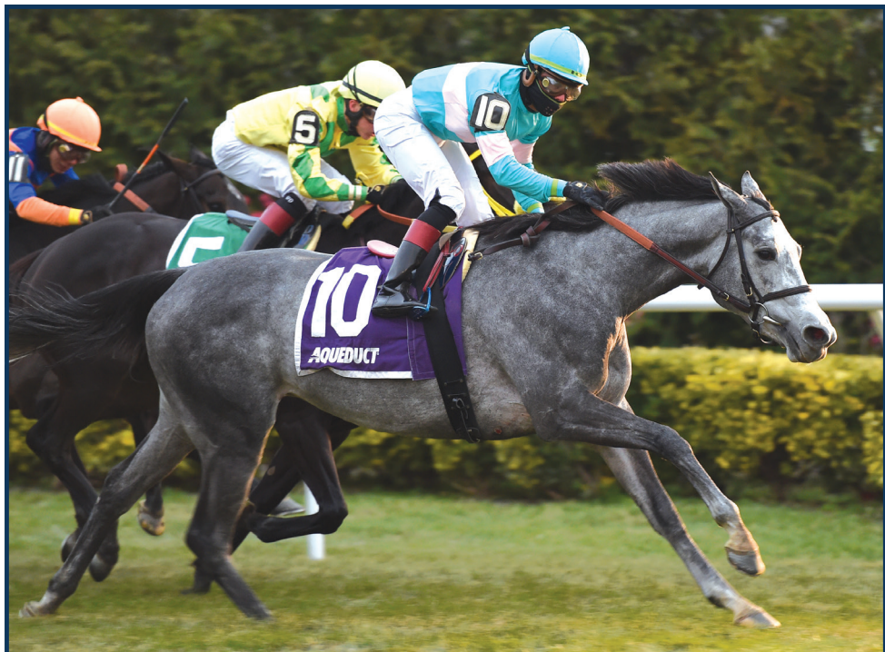
LADY PANAME goes widest of all to win the $400,000 G3 Long Island.