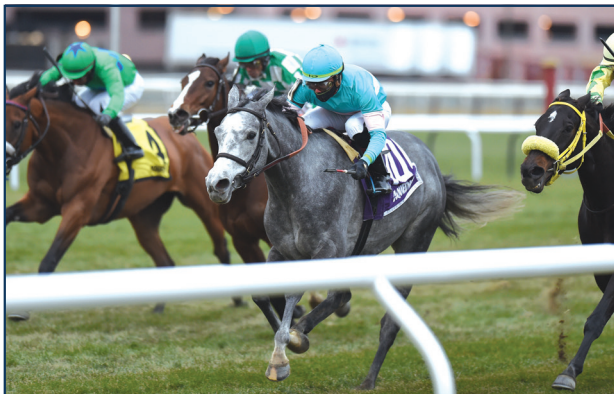
LADY PANAME takes the G3 Long Island.