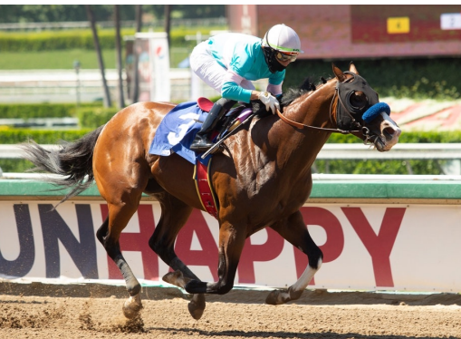
Ragtime Blues takes them gate-to-wire at Santa Anita.