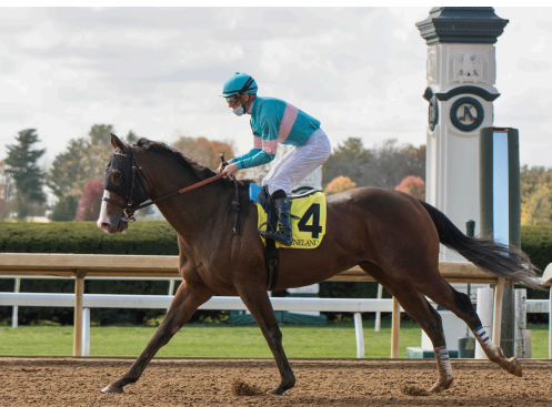
Eel Point strolls home an easy winner at Keeneland.