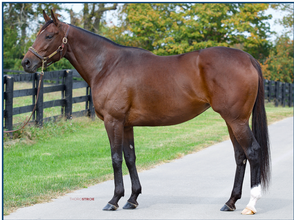
DREAM PASSAGE in October 2020.